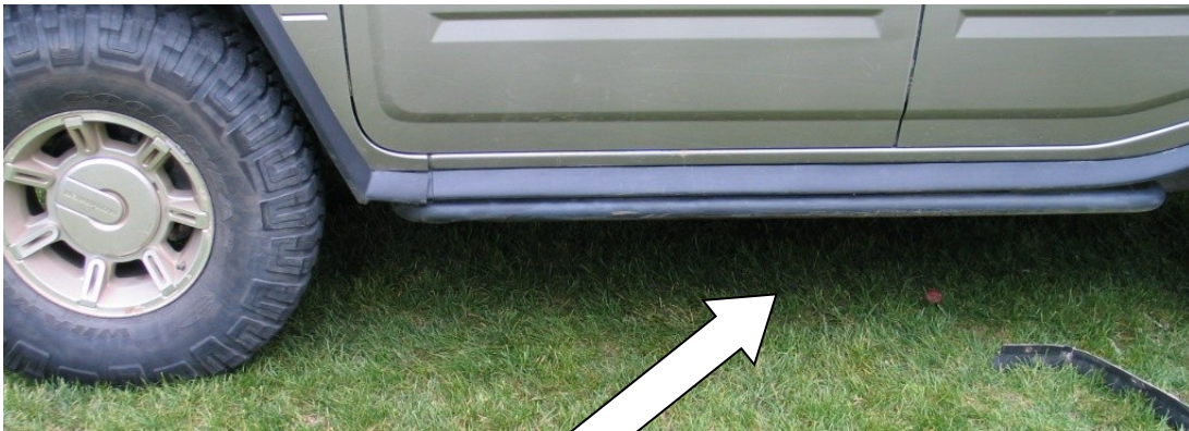
Figure 1: Location of the CVS Drivers side Rocker Panel

The Canister Vent Solenoid (CVS) on the H2 is used for diagnostic purposes. When it's not running diagnostics, it is in place acting as the vent allowing for the air inside the fuel tank to escape and make room for the fuel during refueling, or to allow air to come in while you are consuming fuel. Since it is a solenoid, there is a filter on the "dirty" (atmosphere) side of it. When this filter gets clogged, you will experience the symptoms listed above. The CVS is located under the driver's side rocker panel on the H2.