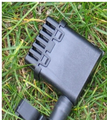
Figure 9: CVS Pre-filter

At the end of the hose, (to the left of the picture in figure 8) you should have something to “pre-filter” the system. It happens that GM has one of those for sale too. Its PN 19152347.