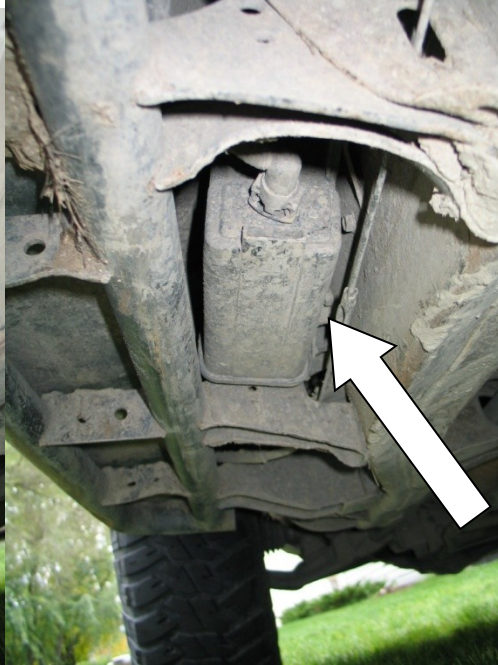
Figure 3: Canister Location

The CVS is mounted “above” the rated water line for the H2 however, as you can see in the above pictures, it can get rather dirty in this location. The big round thing in figure 2 is the filter for the CVS, this is what needs to be cleaned. In figure 3, you see the rectangle thing, which is the canister. The canister’s job is to strip the hydrocarbons from the air that is looking to escape from the fuel tank when you go to fill your Hummer. It does this by having the fuel vapors pass through a chamber(s) of carbon.