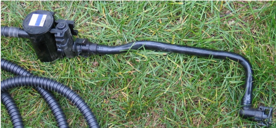
Figure 8: New CVS Filter to old CVS / Hose

If you do not wish to do this “maintenance” in cleaning the CVS filter assembly, there is another option. GM Sells several different variants of the CVS for their Full Size Truck products. You could purchase a CVS that breathes different, through a port, and install it to your current setup. With that, you can attach a hose to vent in a “clean” location. I have found a good location for this is in the pocket behind the driver’s side rear wheel zip tied to the filler pipe.