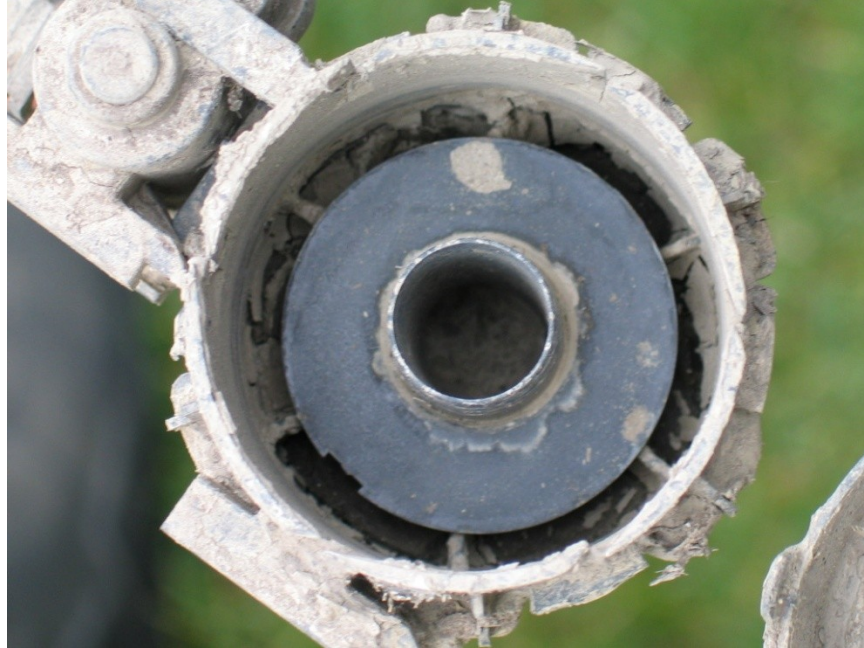
Figure 6: Close up of the dirty CVS filter

As you can see in figure 6, the filter assembly is full of mud. This filter is capable of holding some mud / dust / sand / water, but there is a limit. After each off-road trip it would be wise to check this filter if you have gone through deep mud.