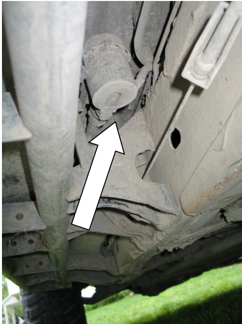
Figure 2: CVS Location