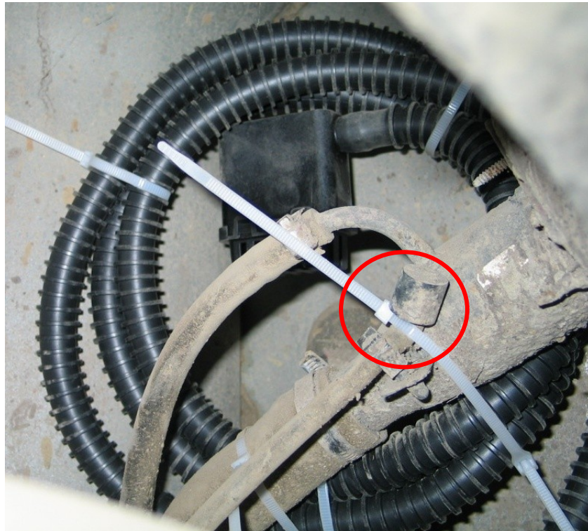
Figure 10: CVS Snorkel mounted to the filler Pipe

both of these parts included, the CVS and pre-filter (you supply the heater hose / zip-ties) which is PN 19152349.